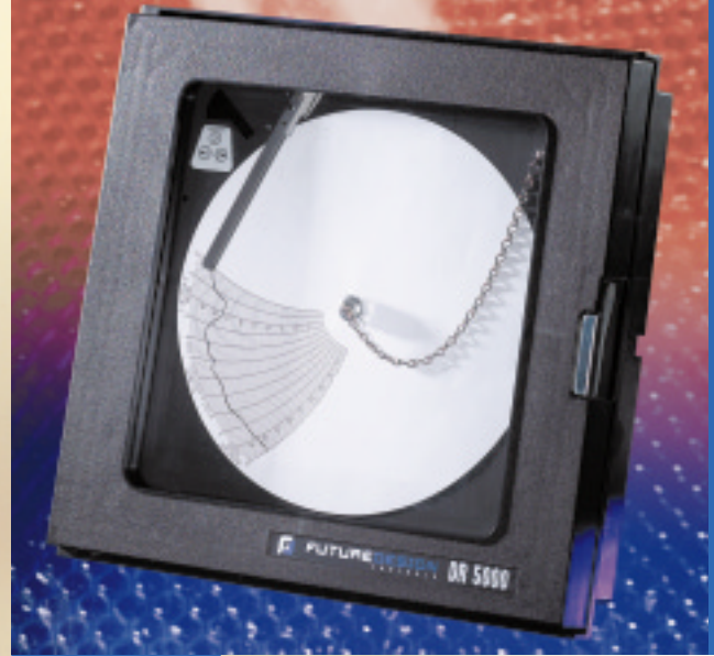
DR 5000 THERMAL CHART RECORDER